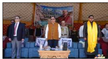
arrival at Khatlse, the district headquarters. The creation of Sham district follows the approval granted by the Lieutenant Governor on April 27, 2026, for the creation of five new districts in the Union Territory of Ladakh. Sham district comprises 27 revenue villages, including five villages carved out from Kargi district and 22 villages from Leh district. Speaking on the occasion, the Lieutenant Governor congratulated the people on the fulfilment of their long-pending aspiration. (Contd on Pg 2)

LEH, MAY 26: Lieutenant Governor, Vinai Kumar Saxena, today visited Khatlse, and participated in the celebrations marking the creation of Sham as a new district in Ladakh. This is L-G's first visit to Sham after its inception as a new district. Amid enthusiastic public participation and cultural performances, L-G Shri Saxena was accorded a grand traditional welcome by villagers, public representatives, students, cultural troupes and members of civil society on his arrival at Khatlse, the district headquarters. The creation of Sham district follows the approval granted by the Lieutenant Governor on April 27, 2026, for the creation of five new districts in the Union Territory of Ladakh. Sham district comprises 27 revenue villages, including five villages carved out from Kargi district and 22 villages from Leh district. Speaking on the occasion, the Lieutenant Governor congratulated the people on the fulfilment of their long-pending aspiration. (Contd on Pg 2)